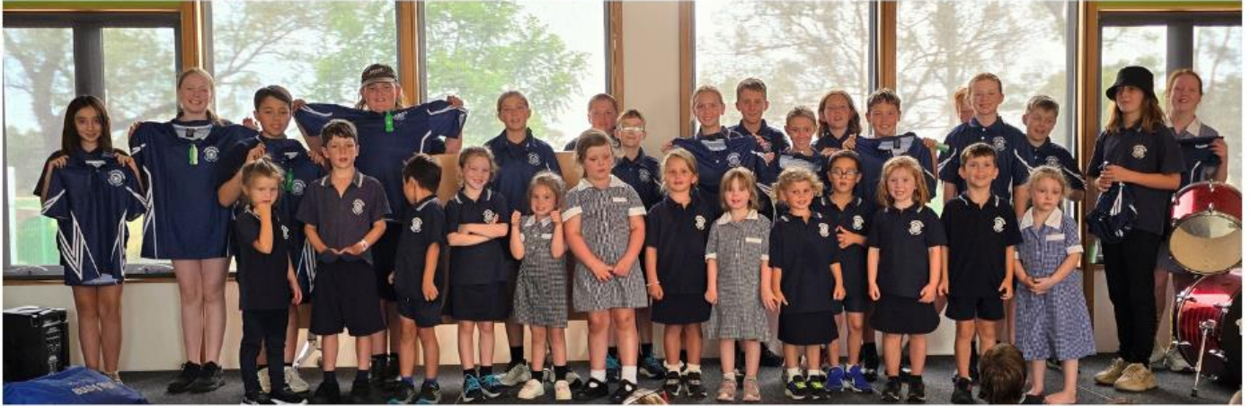
Grade 6 were presented with their shirts by our 2025 Preps at assembly this week.